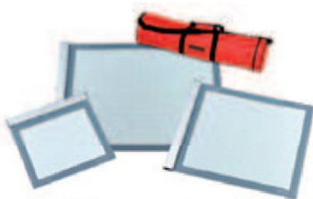
Roll-Up III digitizers come in various sizes with an optional travel case