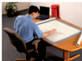
Roll-Up III digitizers lay flat and can maintain a smooth work surface